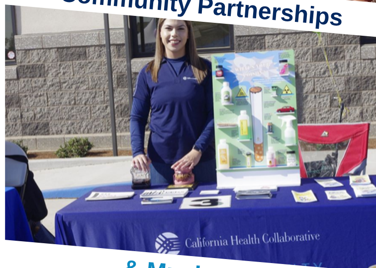
& Much More!