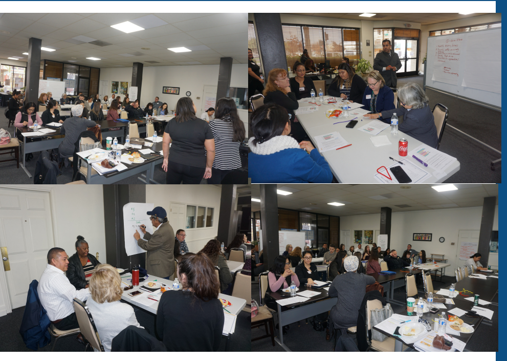
The previous meeting took place on December 11, 2018, at The Vault Works in Merced